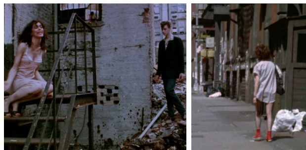
Scenes from Desperately Seeking Susan . Orion Pictures.

An ensuing case of amnesia allows Roberta to briefly become Susan – wearing her clothes, working her old job, and exploring the city by motorbike. For Roberta, Susan, like the city itself, represents the danger and excitement missing from her settled, middle-class existence. By trying on Susan's more adventurous way of life, Roberta begins to come into her own.