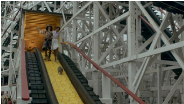
Scene from The Wiz . Universal Pictures.

also encounters spaces negatively impacted by the City’s “urban renewal” initiatives; she finds the Scarecrow (Michael Jackson) near piles of rubble and an abandoned free-standing tenement, which gives the impression that the surrounding structures had been razed.