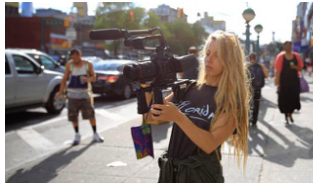
Filmmaker Crystal Moselle on location.

The burgeoning of streaming media platforms, film festivals, and appreciation of film culture has allowed The Wolfpack to achieve a large audience that usually eludes documentary films. Despite being produced on a low budget by a first-time filmmaker, The Wolfpack has gone on to worldwide distribution and popular success, selling out both art cinemas like Film Forum and huge megaplexes like Loews Lincoln Square, instant accessibility on streaming video platforms, and critical acclaim with a grand jury prize at Sundance. The film's success speaks to the strength of American independent cinema and the passionate creativity of its innovators, which can be traced back to its start in the LES's New American Cinema and the Young Filmmaker's Foundation. It also affirms that DIY filmmaking remains as potent a tool for the positive self-expression, and even freedom, of young people, poor people, women, and people of color today as it was in the 1960s.