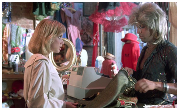
Roseanne Arquette in Desperately Seeking Susan.

After spotting Susan at the southernmost tip of Manhattan, Roberta covertly follows her into the East Village, where Susan trades her signature jacket for a pair of rhinestone boots at the iconic vintage shop Love Saves the Day. Roberta purchases the jacket, which she is wearing when mobsters, mistaking her for Susan, knock her unconscious.