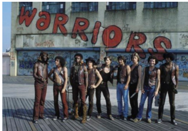
Scene from Coney Island cult classic The Warriors.

romantic rendezvous. Memorable scenes in films such as Speedy (Wilde, 1928), The Crowd (Vidor, 1928), The Gilded Lily (Ruggles, 1935), Who is Harry Kellerman and Why is He Saying Those Terrible Things About Me? (Grosbard, 1971), and Radio Days (Allen, 1987) all portray Coney Island as a romantic place. Crossover Dreams , however, expands the claim to Coney Island to Latino characters.