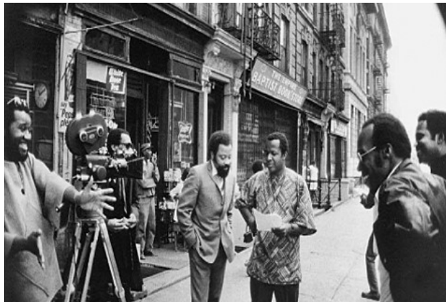
Black Journal still.

The films in this chapter mark the return of black independent filmmaking to Harlem during the late 1960s through the late 1980s, a time of grassroots organizing, the Black Arts movement, and collective reflection on the meaning of black identity. This period, sometimes called “the urban crisis,” was characterized by major social changes throughout New York caused by the loss of manufacturing jobs, rising rents, the breakdown of social services, and increasing violent crime. In mainstream Hollywood film and popular culture of the time, Harlem was simultaneously invisible – rarely shown on screen, and never the site of location shooting – and a looming threat to audiences, a space of fear that reinforced negative stereotypes about African Americans.