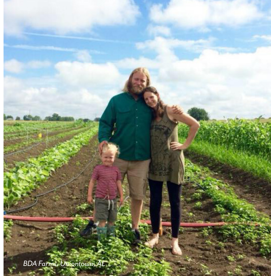
BDA Farms, Uniontown, AL

“Municipal relief programs can help break a cycle that nutrient-dense, high quality food has to travel farther than needed to feed people.”