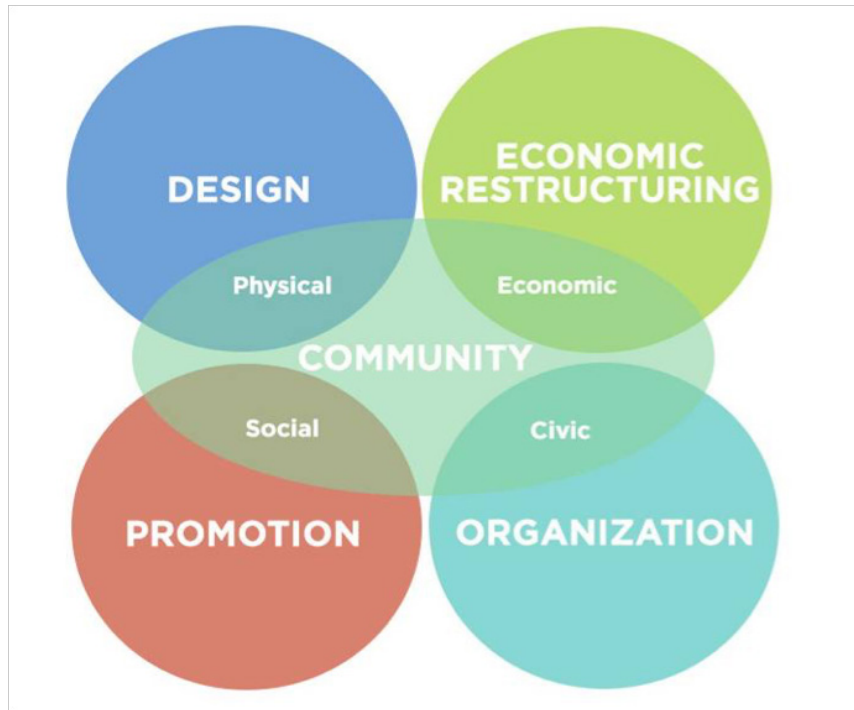
The Main Street Approach showing how the Four Points correspond with the four elements of real estate value - Physical, Economic, Social, and Civic.

The structure of the MDA organization and how we describe groupings of people is changing. The traditional Main Street Approach had Committees coinciding with each of the four points. The Main Street New Jersey program substituted “Committee” with “Team” to create a sense of shared purpose. We have chosen the “Team” nomenclature to describe how we choose to organize people around our work. Moving forward every Team and Project will tie back to a Transformation Strategy and ultimately to the new Mission and Vision of the organization.