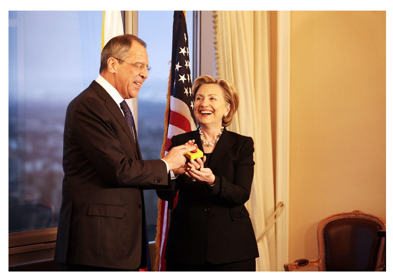
"Restart Button" offered by U.S. Secretary of State Hillary Rodham Clinton to Russian Foreign Minister Sergey Lavrov in Geneva, Switzerland March 6, 2009.