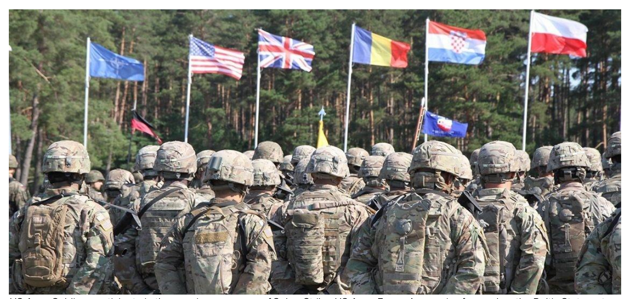
US Army Soldiers participate in the opening ceremony of Saber Strike, US Army Europe's exercise focused on the Baltic States, at the Bemowo Piskie Training Area in Poland on Monday, June 4, 2018.

The authors have argued in this paper that there is potential for positive change in Russia. The United States should now consider how to respond to it. New leadership in the Kremlin, when it finally arrives, will seek to advance its own agenda, not that of the United States, and for its own reasons. But, new leadership seeking to end Russia's internal stagnation and external isolation may be more open to settling the worst outstanding disputes, like Ukraine, and exploring the basis for a genuine shift in relations toward partnership and mutually beneficial cooperation, picking up where things left off two decades ago. The political circumstances of such new leadership may be far more favorable than they were for Yeltsin; they will not be weighed down by the Soviet imperial collapse or the chaotic results of incomplete and spotty reforms.