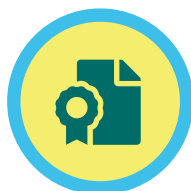
National Board Certification for Faculty