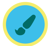
Arts, Enrichment, and Innovation