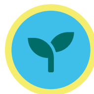
Mentoring and Community Engagement