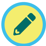
Curriculum and Instruction