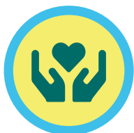
Mental Health and Suicide Prevention