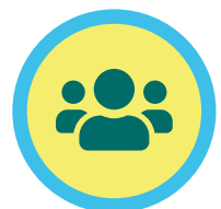
Equity and Inclusion