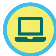
Computer Science and STEM