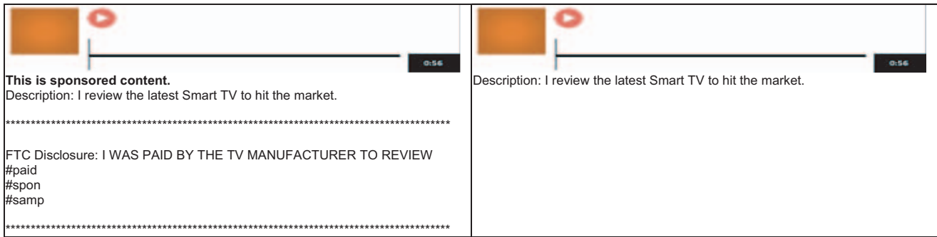
Figure 1. Experiment 1: A comparison of the disclosure statement condition (left) to the no disclosure statement condition (right). See the online article for the color version of this figure.

Second, we manipulated paralinguage. Participants listened to a randomly selected recording that either did or did not include a paralinguistic persuasion attempt.