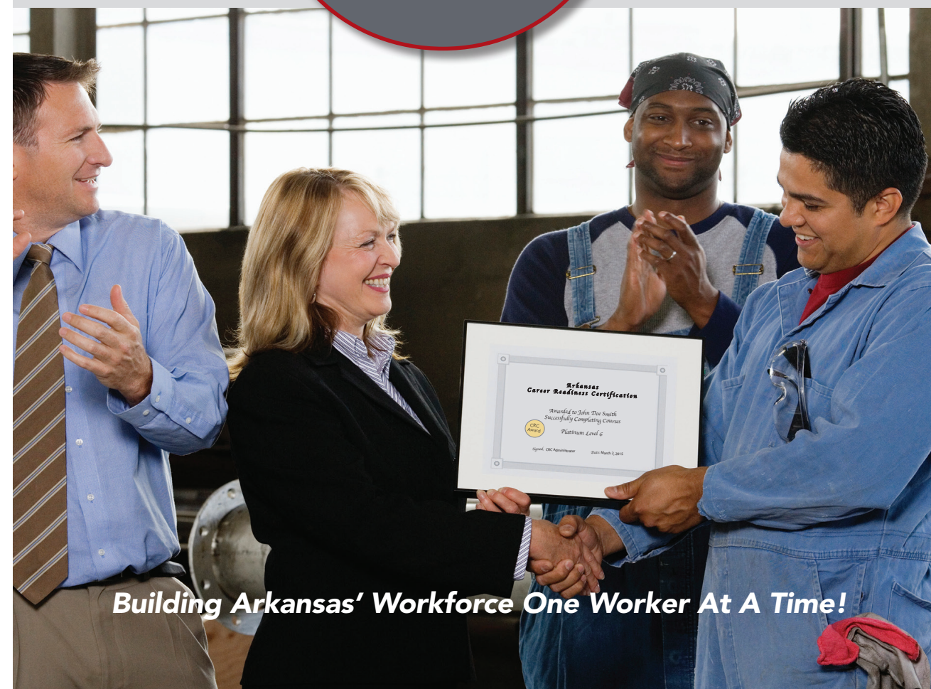
Building Arkansas' Workforce One Worker At A Time!