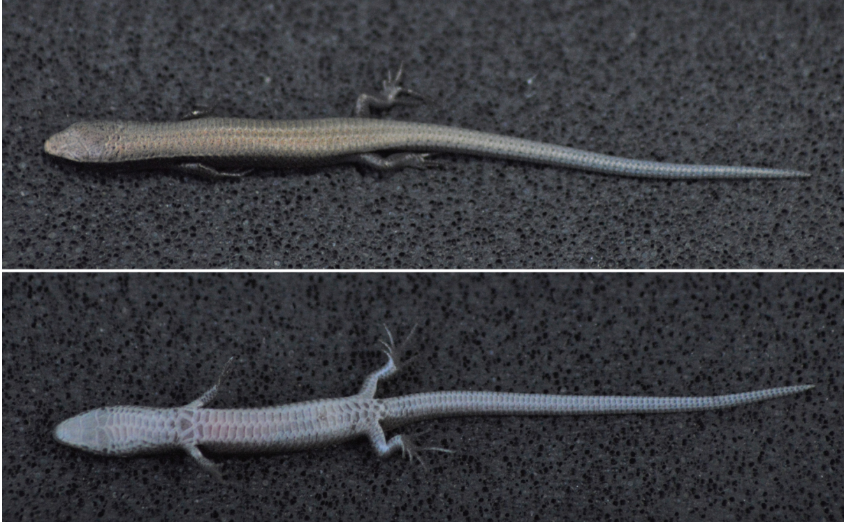
Figure 2. Dorsal and ventral side of juvenile Gymnophthalmus underwoodi (SVL 19.5 mm) on St. Eustatius. Rule units in centimeters.