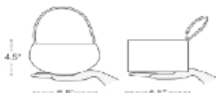
Small Clutch Bag No larger than 4.5" x 6.5"