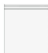
Plastic Storage Bag 1 Gallon resealable, clear