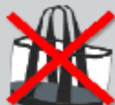
Oversized Tote Bag