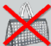
Tinted, Colored or Pattern Plastic Bag