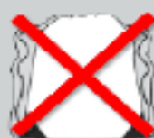
Drawstring Bag Solid (clear permitted)