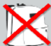
Backpack Solid or clear