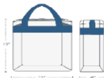
Clear Bag No larger than 12" x 6" x 12"