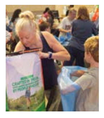
11,000 LBS Pet food bagged for aniMeals