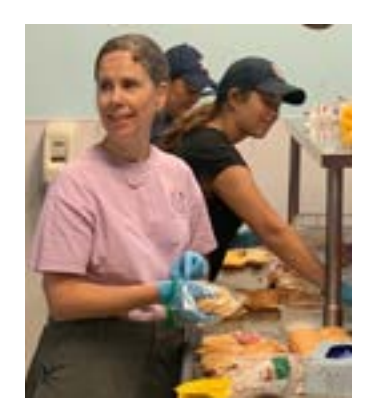
32,500 Sandwiches made for Kids' Meals in 2019