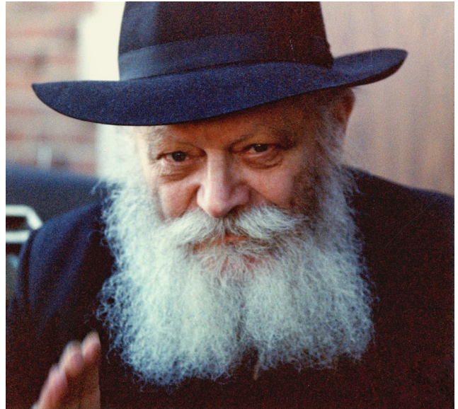
Lubavitcher Rebbe, circa 1987

From 1950 until his death in 1994, Menachem Schneerson, simply known as The Rebbe, led the Chabad Lubavitch Hasidic Jews to become one of the most dynamic forces in Judaism today. Chabad is an acronym for Hesed (“charity”), Binah (“understanding”) and Daat (“knowledge”). Lubavitch is the town in White Russia from where this sect originated. Many followers of Chabad today believe that the Rebbe is the Messiah who will rise from the dead. Today, Chabad is a worldwide movement with more than 4,700 shalichim (“emissaries”) in approximately 100 countries. Their extensive outreach efforts include encouraging secular Jews to return to traditional Judaism through educational programs and seminars, Shabbat dinners, holiday celebrations, and family activities in a welcoming community atmosphere. Chabad embraces Jewish people from all different backgrounds. Due to their outreach efforts, this is the most accessible group of Hasidic Jews, and they are often very open to discussing spiritual matters. Even though our ideas of the Messiah are quite different, there are many points with which we can connect to begin conversations.