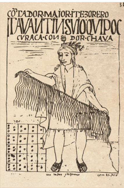
A khipucamayuc. Felipe Guaman Poma de Ayala (Quechua, 1535–1616). Pen and ink drawing published in The First New Chronical and Good Government (1615). Royal Library, Copenhagen GKS 2232 4°

The best-known use of khipus was for accounting purposes. A series of knots tied at different places along the vertical strings represented numbers into the thousands. They recorded such things as the amount of corn in a colca (a storage house), the number of households in a village, and how many llamas were traveling on the Inka Road. Some khipus were very complex and included hundreds of cords and knots.