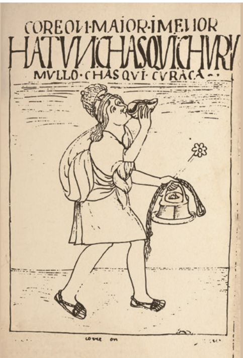
A chaski. Felipe Guaman Poma de Ayala (Quechua, 1535–1616). Pen and ink drawing published in The First New Chronical and Good Government (1615). Royal Library, Copenhagen GKS 2232 4°

Runners traveled 10 to 15 kilometers (6 to 9 miles) until they reached a chaskiwasi , a small house where another chaski was waiting to run the next segment of the relay. Each chaski carried a small personal bag with light-weight objects such as a kipu (an accounting system made up of hand-tied knots) and a shell trumpet. Sometimes the runners