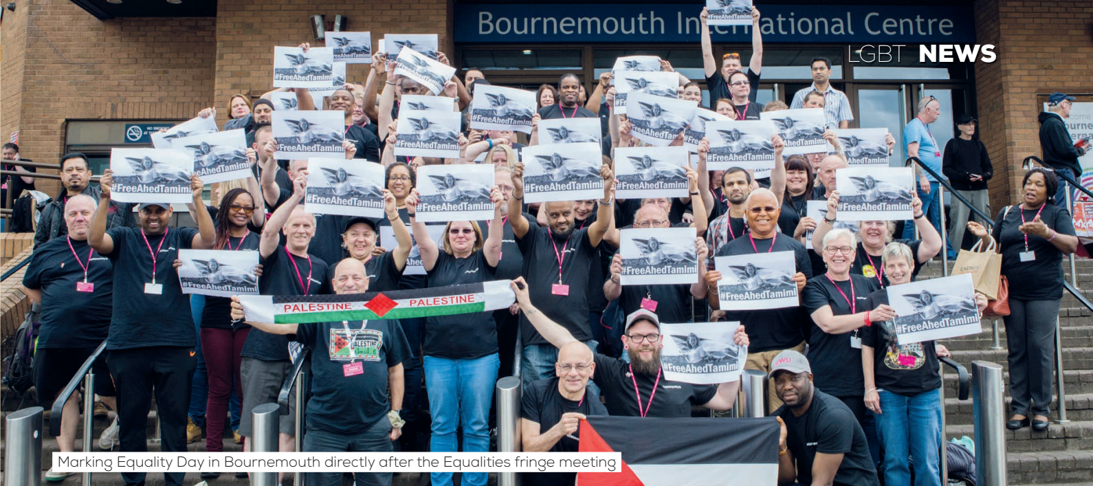
Marking Equality Day in Bournemouth directly after the Equalities fringe meeting